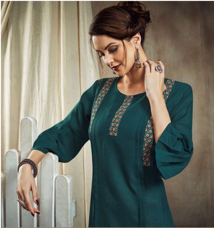
A breath taking array of fine detailing & intricate design inspired by Indian culture. 2021