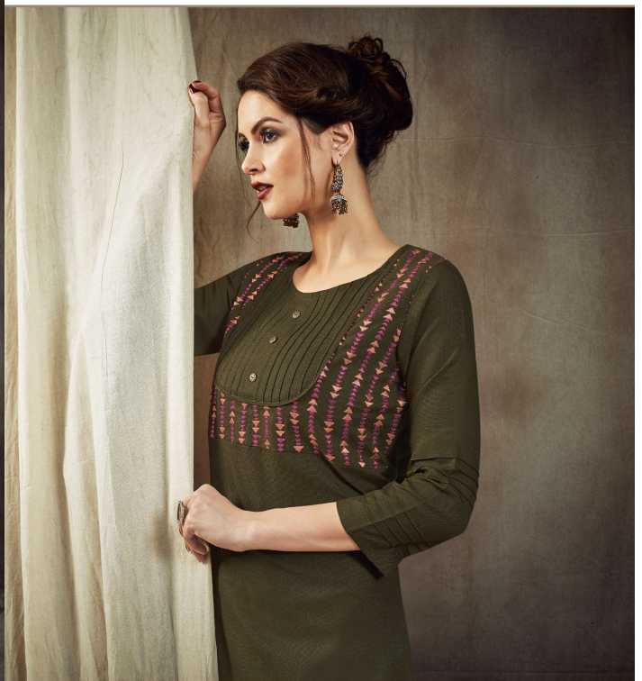
A scintillating plethora of timeless masterpieces inspired by beauty from Indian culture. 2020